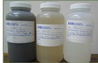
Surface drained field, Surface drainage from a tiled field, and tile drainage water samples, respectively (L to R).